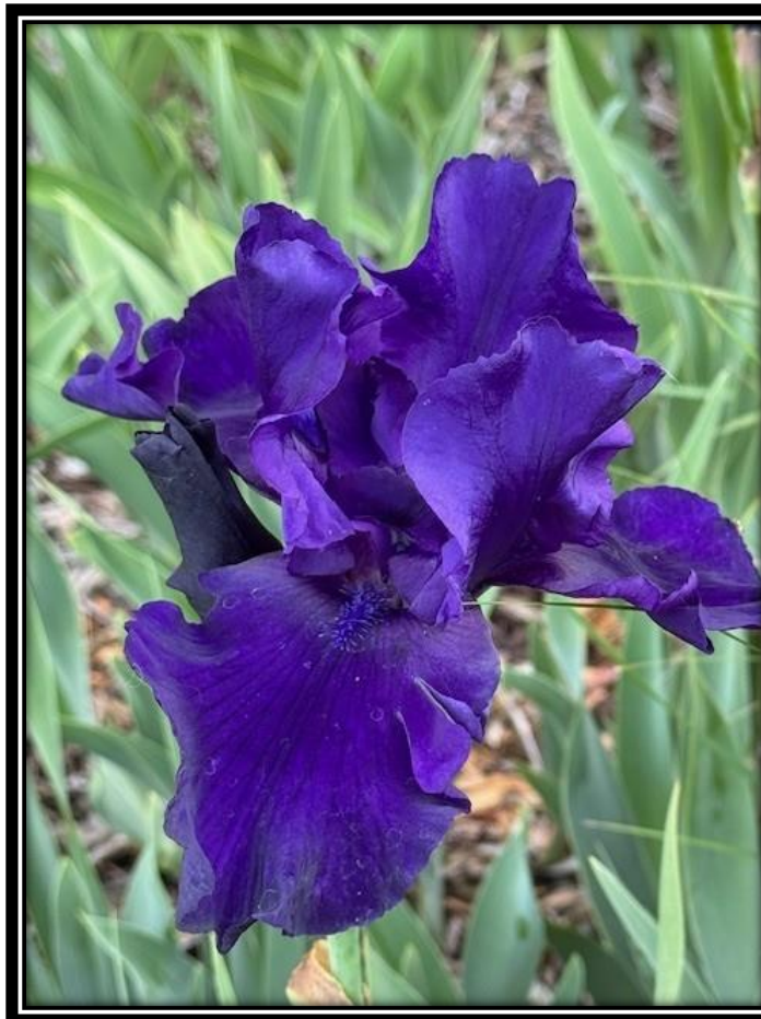
Iris from our Healing Garden

We hope you like the new look of the Intercom.