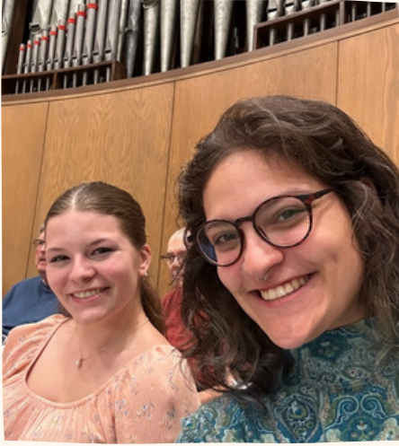
Two new members of the Adult Choir worshipping at Sunday Festive

When was the last time you did something for the first time? Many of us have attended church regularly for many years and not tried anything new for a long time. It's our prayer that ALL of us, young and old, will consider ourselves CALLED to serve and try something new this fall.